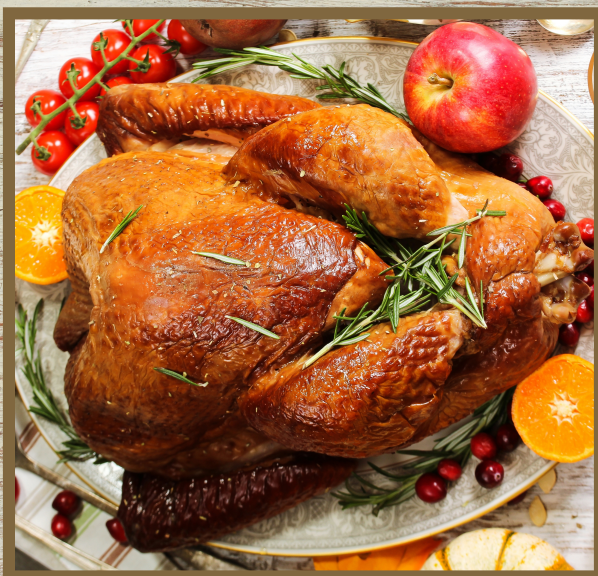
DINE AT THE CLUB